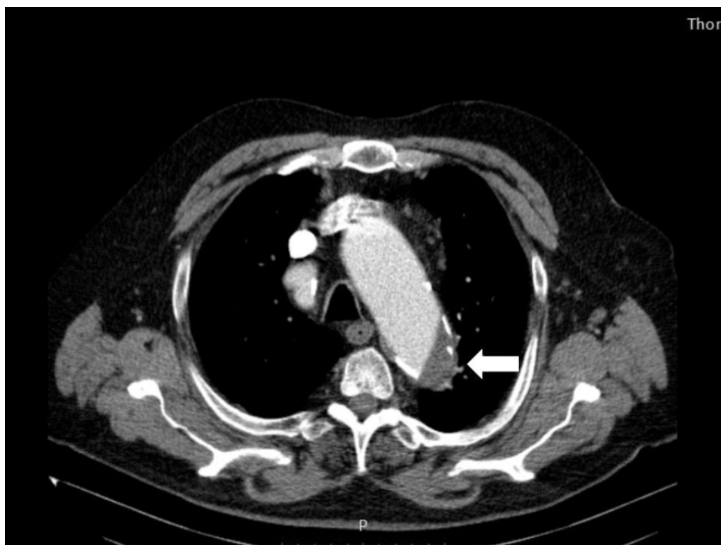
Figure 2. Thoracic angio CT: beginning of aortic dissection from the distal part of the aortic arch (white line) along with multiple calcified atheroma plaques.

discharge consisted in: low regime of novel oral anti-coagulant (apixaban 2.5 mg bid), diltiazem, amiodarone in prophylactic dose, high statin dose (rosuvastatin 20 mg daily), angiotensin converting enzyme inhibitor and oral venous trophic. One dilemma was for introducing aspirin for the high atherosclerotic burden but taking into consideration the age, the acute thromboembolic pathology and the need for chronic anticoagulant, we decided to postpone the administration of aspirin in prophylactic dose.