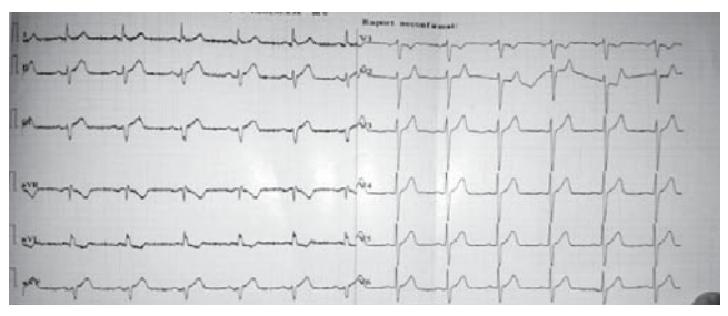
Figure I. Electrocardiogram performed one hour after arrival in the emergency service.

Additional laboratory tests shows neutrophilic leukocytosis, slightly increased level of C-reactive pro-