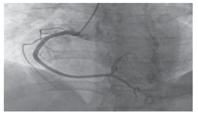
Figure 5. Right coronary artery.