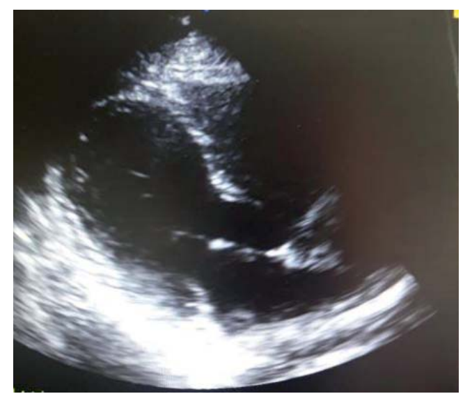
Figure 3. Echocardiography performed at the admission-parasternal long axis section.

Coronary angiography. Based on the highly suggestive clinical picture of an acute coronary syndrome, coronary angiography is performed urgently, revealing normal coronary angiography, without arterial plaques or other detectable anomalies (Figure 5,6).