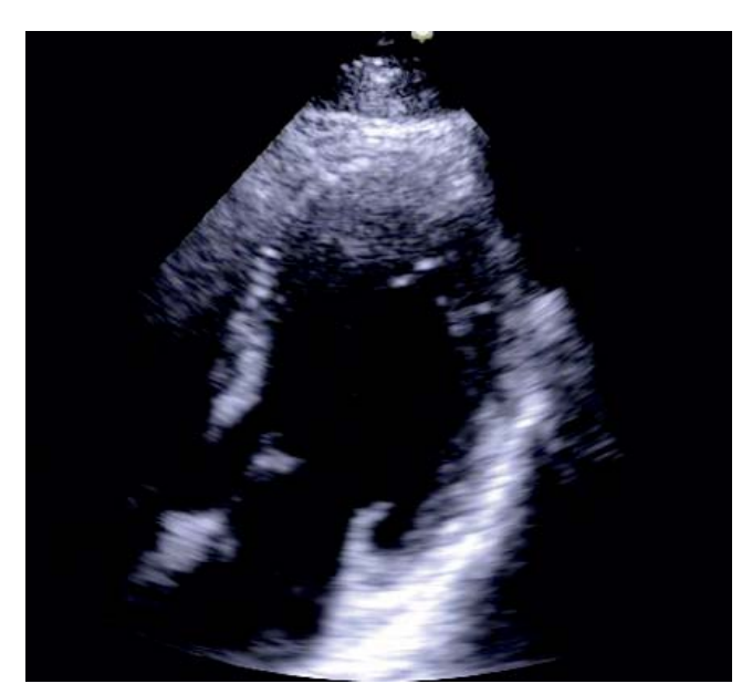
Figure 4. Echocardiography performed at the admission- apical section.