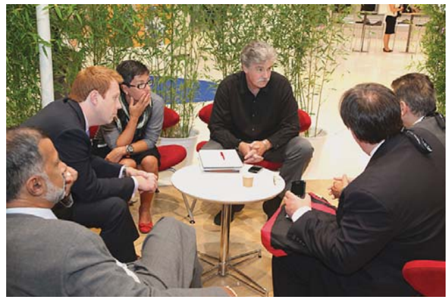
Figure 2. Round table discussions at ESC.

may include presentations in one room on heart failure and in an adjacent room on heart rhythm disturbances. Through the village concept the congress becomes more manageable and interactive. Important new guidelines will be presented at the ESC Congress 2013 on arterial hypertension, cardiac pacing, diabetes, and stable coronary artery disease. Linked to these will be dedicated scientific sessions, case based Focus Sessions.