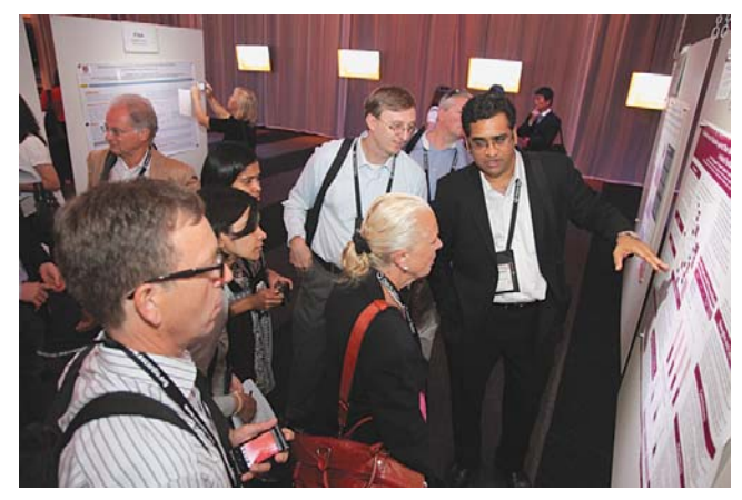
Figure 1. Discussions around a poster at ESC Congress.

There is huge and international enthusiasm for participation in the congress with a record number of submissions for scientific planned sessions (more than 400 were selected) and the second highest ever number of abstracts were submitted (10,490). To make the congress more manageable we have again arranged the congress into "villages" of related topics. Thus, a village