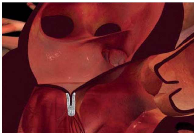
Figure 2. MitraClip procedure.

Usually under general anesthesia, the guide catheter is inserted through the femoral vein to reach the left